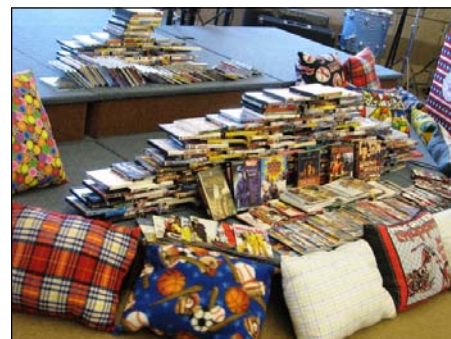
Quilts, pillows, DVDs and more!