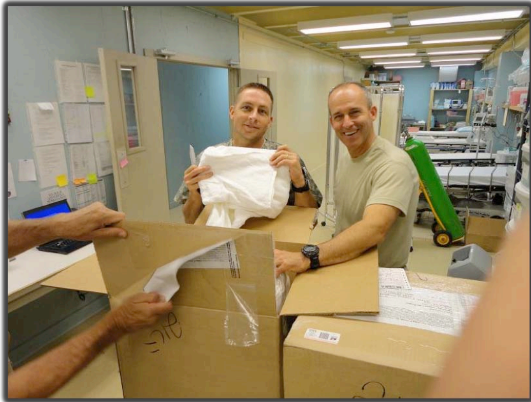
Staff in Afghanistan receiving LHCP shipment